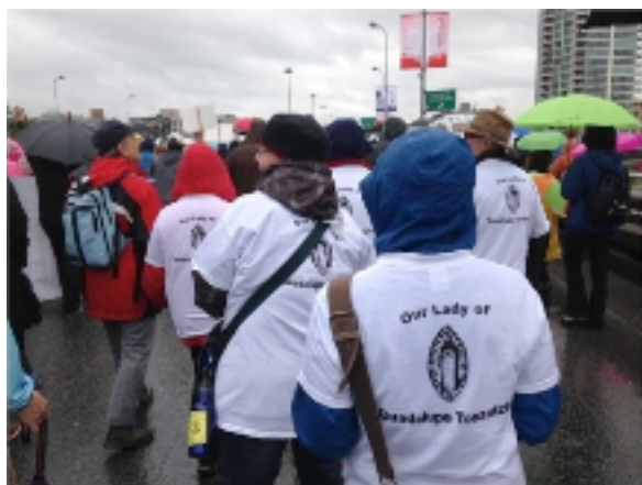
Our Lady of Guadalupe Tonantzin Community on the Walk for Reconciliation

July 29th, 2014 was the second anniversary of the Our Lady of Guadalupe Tonantzin Community (OLGT) and my ordination. This seemed an appropriate time to take stock of our journey as a