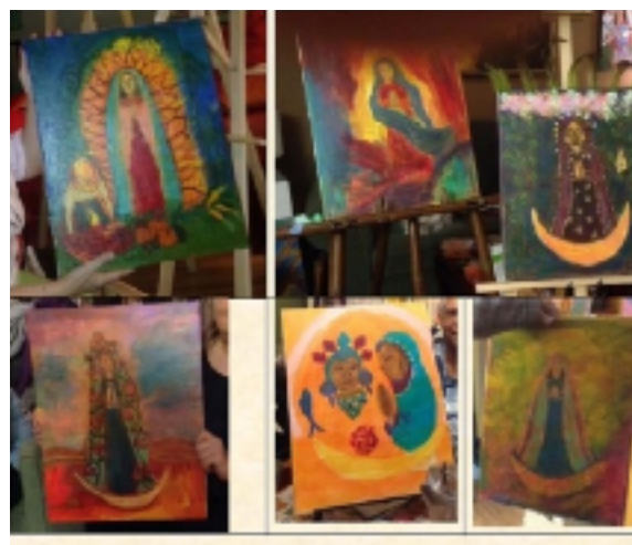
Fruits of OLG Community Art Retreat

This has been a reflection on the ways our community tries to provide each other with opportunities to delve deeper inward in following Christ and connecting with God. We believe that following Christ calls us to be a community that also looks outward to our neighbour. So we continue our inward journey to Love and we continue to seek ways for the outward expression of God's love and compassion. Please keep all of us at the Our Lady of Guadalupe Tonantzin Community in your prayers as we embark on our third year of the journey together.